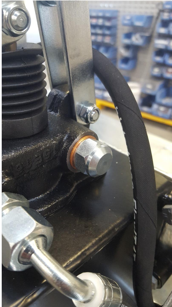
Photo 1 shows a large nut, remove this by turning anti clockwise.

Problem: Hydraulic Jack doesn't work lift/lower properly.